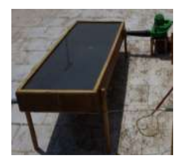
Fig 3: Assembly of Experimental Set up