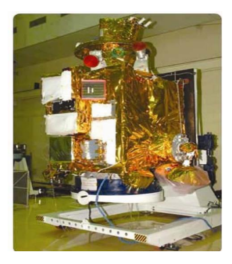
Fig. 1 Chandrayaan- 1 Spacecraft

The mission gave the Indian space programme a significant boost because India successfully studied and domestically built the technology to study the Moon. The mission's main goals were to: * Conduct various scientific experiments using the spacecraft's instruments to produce data for studies * Create a 3-D atlas of the moon's near and far sides * Provide high-resolution chemical and mineral imaging of the entire surface * Learn more about lunar volatiles by observing X-ray spectra in the energy range of 10-200 keV * Find evidence of water on the moon.On November 8, 2008, Chandrayaan-1 was launched aboard the PSLV-C11 launch vehicle, which successfully sent the spacecraft into lunar orbit. India became the fourth nation in the world to raise its flag on the lunar surface on November 14, 2008, after MIP (Moon Impact Probe) was successfully detached. MIP had previously made a controlled impact on the lunar South Pole. Due to a number of technical problems and a contact failure on August 29, 2009, the mission was officially deemed a failure after almost a year. Despite operating for only 312 days instead of the two years anticipated, Chandrayaan was a success since it met 95% of its intended goals. The most important finding made by Chandrayaan-1 was the abundance of water molecules in the lunar soil.