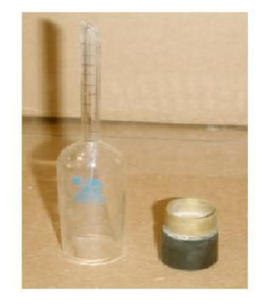
Figure 2 Glass Indicator and Cup/Stopper (Forney Model LA-0340)

Because of this, a fresh test was carried out, or an assumption was made in the event that obstacles could not be circumvented. However, the water that was coming from the petcock in each instance was of a smaller volume than what would be considered normal, and it needed a substantial amount of pressure from the bulb that was delivering the input water. When attempting to determine air contents using the Chase Indicator Kit, we ran across a number of challenges as well. The test required the acquisition of a sample of mortar that was indicative of the whole. In order to carry out this test accurately, it was necessary to remove from the mortar sample any sand particles that were larger than the No. 10 sieve's 2 millimetre (0.079 inch) tolerance. This turned out to be a challenging process, which led to part of the aggregate being stuck in the constricting neck of the tube. As a result, the tests had to be redone. When the extra mortar sample was struck from the top of the cup, the flowable nature of the paste may have allowed more air to escape than in a typical mixed design, leading to an air content measurement that was lower than what was really there. Figure 4.1 depicts the tube and cup/stopper that come with the Chase Air Indicator Kit (Forney model LA-0340).