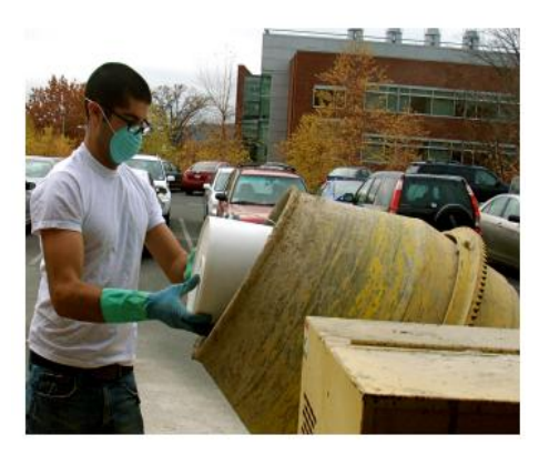
Figure 1 Depiction of Addition of Aggregate to the Mixer

When the coarse aggregate had absorbed an adequate amount of moisture, the fine aggregate (sand and/or fine-size glass) was added. This was followed by the coarse aggregate being thoroughly combined with the fine aggregate until a homogenous mixture was achieved. After that, the cement, PFA, and the majority of the water that was left over were added, and the mixture was stirred for two minutes (Figure 3.8).